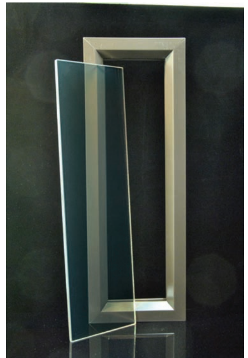
Vision Lite Kit with PYRAN® PLATINUM F